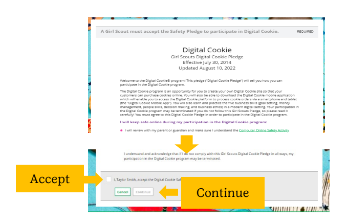
Step 4: Then, read the "Girl Scout Safety Pledge."

After she has read the pledge, she can click the box to accept it and then click "Continue" be taken to the home page of her site to set it up.