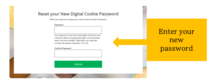
Step 4: You will be taken to a page to reset your password.

Step 5: If you do not receive an email to reset your password in 15 minutes, return to the login page in step 1 again, click "forgot password" and this time select "Contact Customer Support" to be taken to a customer service form.