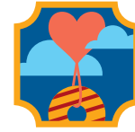
My Cookie Business Resume